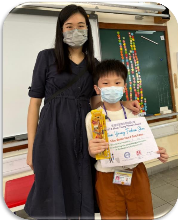
The smartest costume