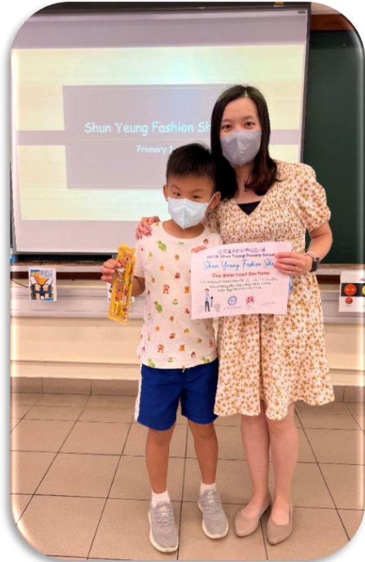
The smartest costume