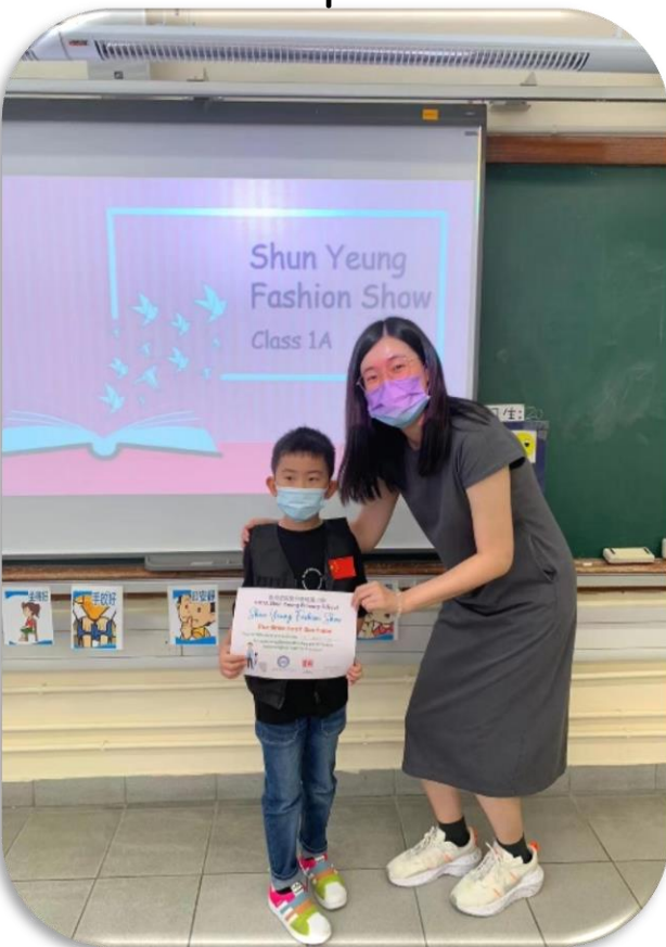
The smartest costume