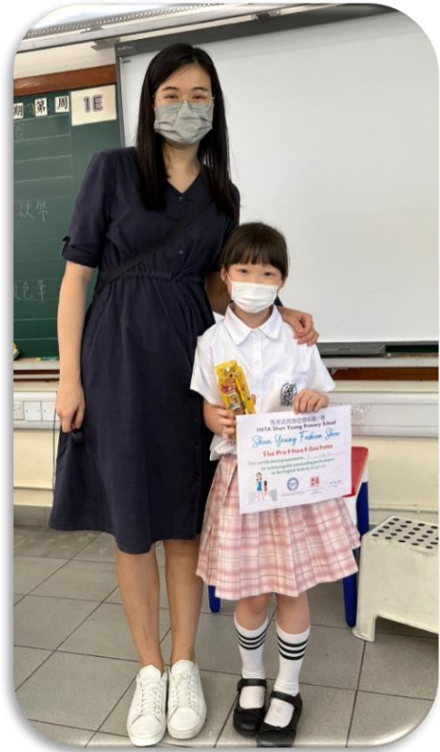
The prettiest costume