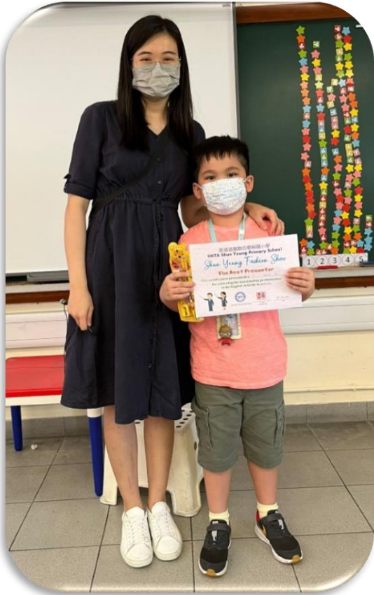
The best presenter