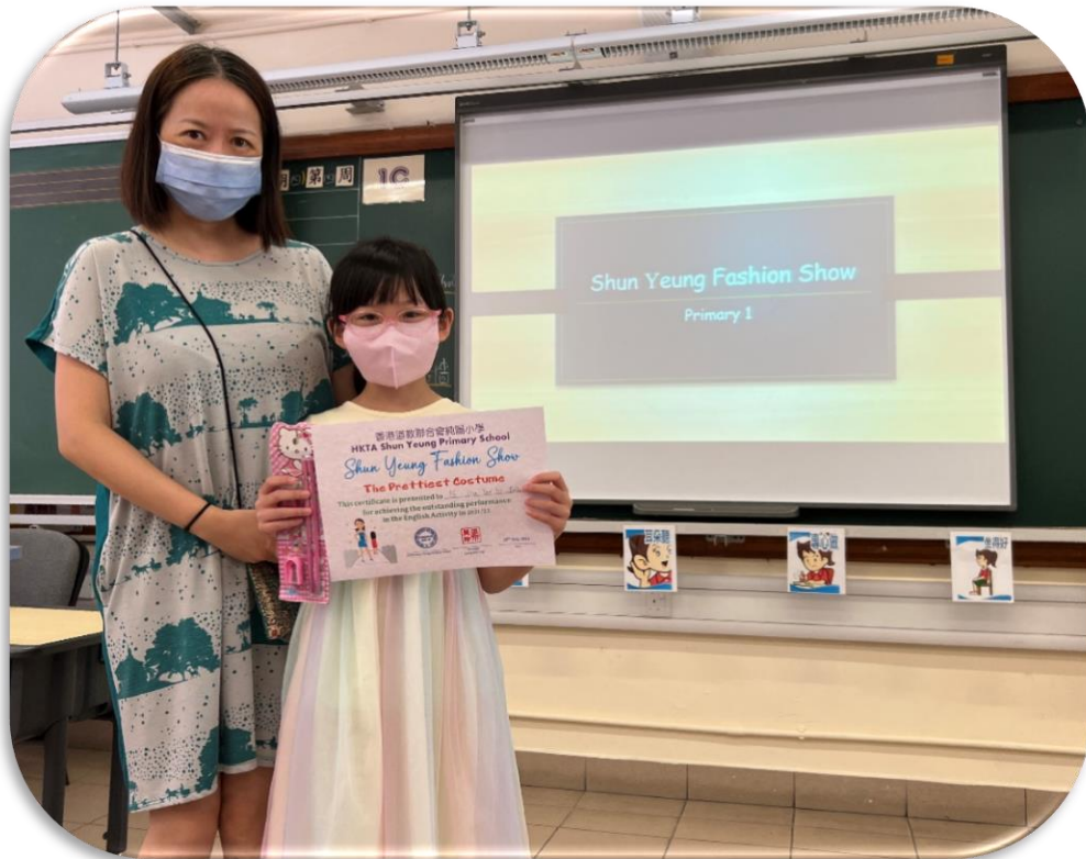
The prettiest costume