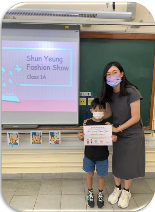
The best presenter