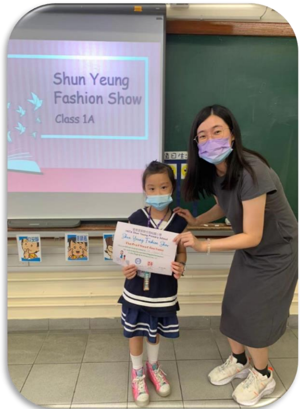
The prettiest costume