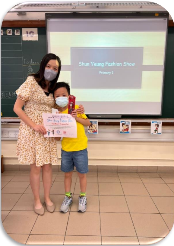
The best presenter