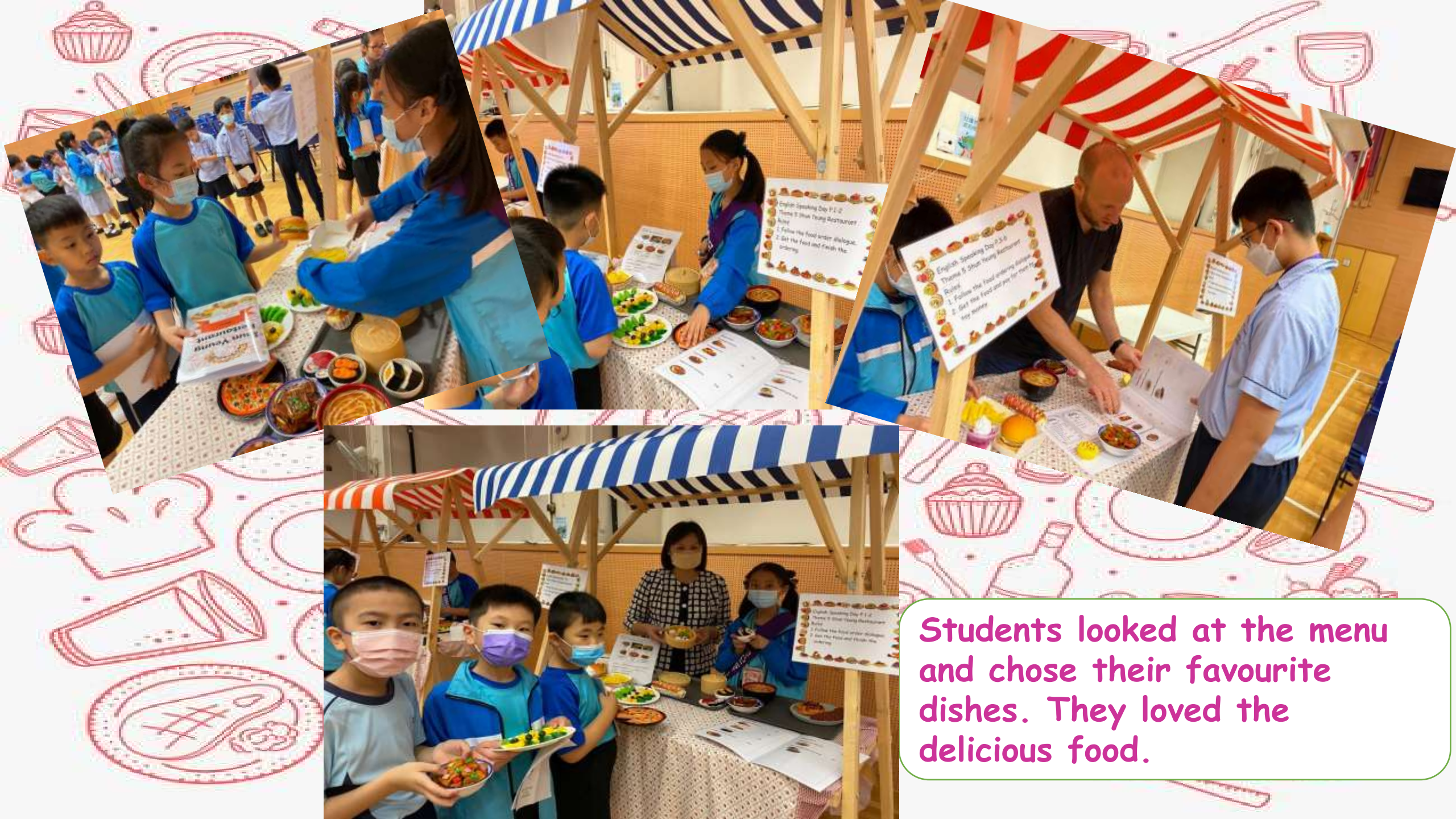
Students looked at the menu and chose their favourite dishes. They loved the delicious food.